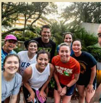
A moment from WTS 2025 : The first-ever Women in Thoracic Surgery Fun Run marked an energizing start to the conference, bringing attendees together for a four-mile run and celebrating community, wellness, and connection.