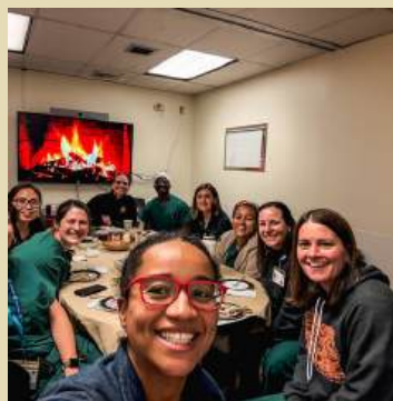
Throughout the Thanksgiving holiday, the ZSFG team continued to provide exceptional care while also creating a sense of community within the hospital. Staff came together to share a Thanksgiving meal, reflecting the teamwork and compassion that sustain our patients and one another. We are deeply grateful to the nurses, physicians, APPs, trainees, and staff who made the holiday meaningful while remaining steadfast in their care.