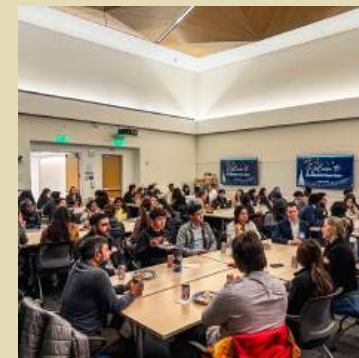
At the Surgery Interest Group x Muriel Steele Society mixer, students participated in rotating meet-and-greet sessions, with one faculty member stationed at each table, creating focused conversations and meaningful opportunities to explore surgical careers and build lasting connections across the department.