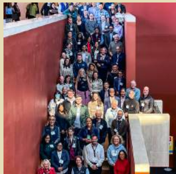
In November, UCSF Surgery hosted its annual faculty retreat, "The Financial Future of Academic Medicine." Leaders from across UCSF and UCSF Health came together to discuss innovation, sustainability, and strategic approaches to strengthening the department's clinical and research mission.